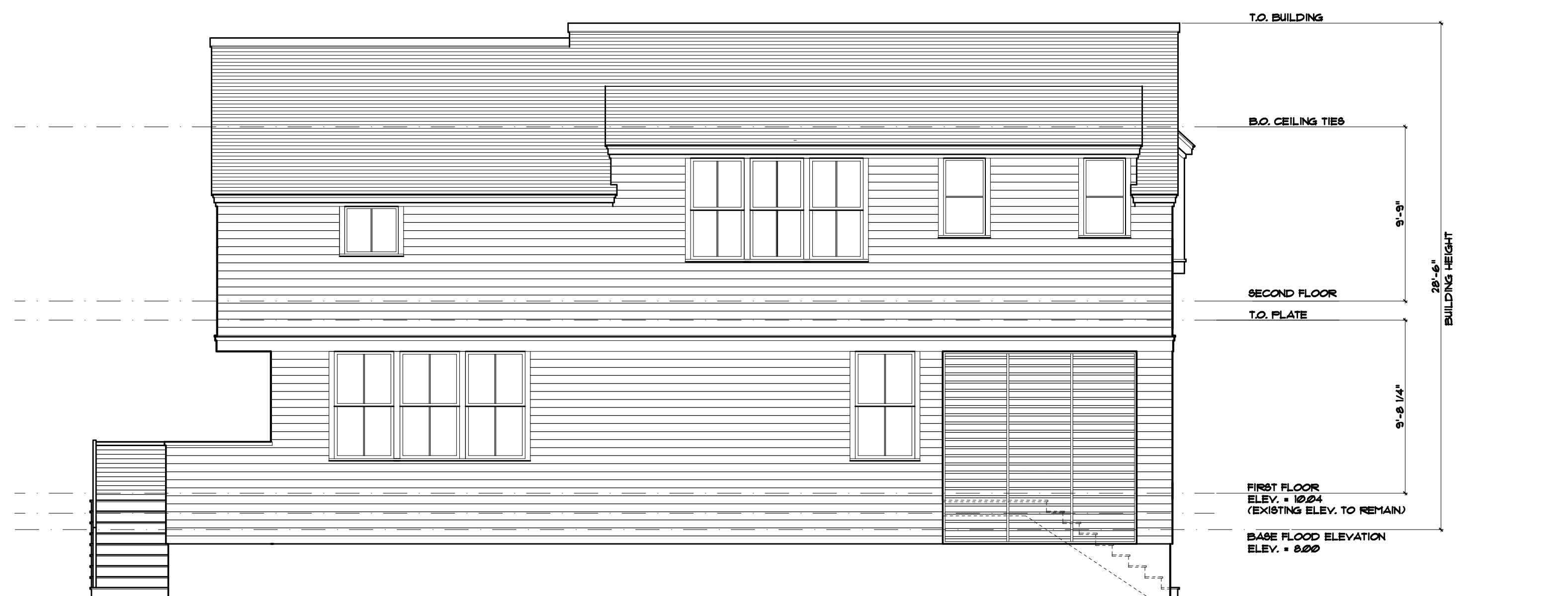
2 2 East Elevation SCALE: 3/16" = 1'-0"