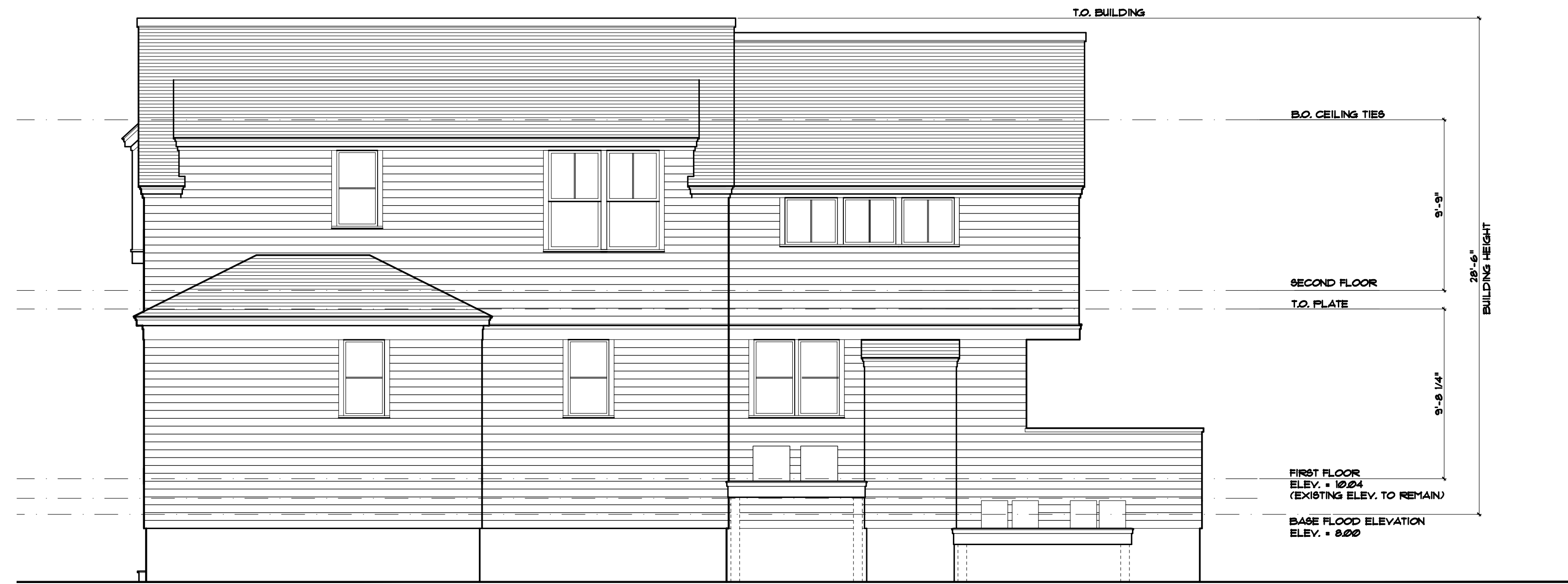
3 2 West Elevation SCALE: 3/16" = 1'-0"